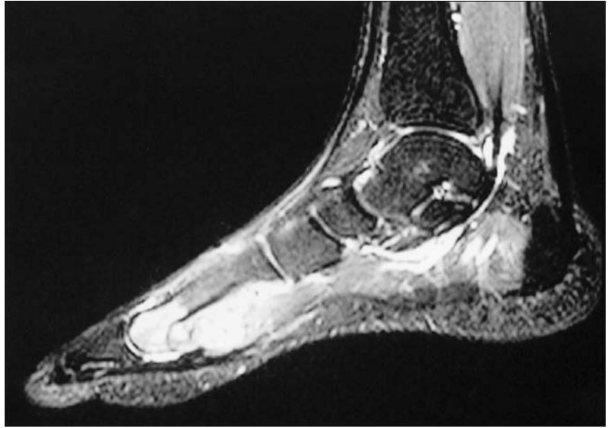
FIG. 3. Sagittal STIR weighted magnetic resonance image showing focal bone marrow changes.

Conventional radiographs are usually normal. CT and magnetic resonance imaging (MRI) are required to detect and characterize clear cell sarcoma. 1 MRI shows a homogeneous mass of T_1 and T_2 -weighted images. Sixty-seven percent of lesions were well-defined, with bone destruction seen in 10% of the cases. 5 Histologically, the mass reveals a cluster of