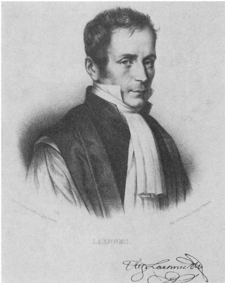
FIG. 2. Portrait of Doctor René Théophile Laennec.

Of the physicians of the Paris school of medicine in the early nineteenth century, in the days of its pre-eminence, René Laennec, the Breton, is best remembered. His invention of the stethoscope in 1816 (the year after Waterloo), his development of the physical examination of the chest, and his correlation of auscultation and pathological anatomy began a method in chest medicine, which, reinforced and not superseded by radiology and thoracotomy, is still ours. Laennec died at his home at Kerlouarnec in Finistère on the 13th August, 1826, only five months after writing this certificate. It is interesting to see the similarity of the signature on the certificate to that reproduced on the portrait of Laennec (Figure 2).