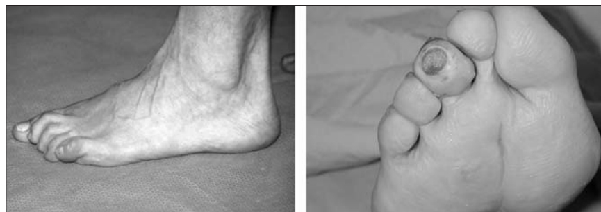
FIG. 2. Left: Patient with a 15-year history of diabetes. Patient has a high arched foot with equinus contracture and clawing of the lesser toes. These subtle deformities have been precipitated by the motor neuropathy. Right: Ulceration at tip of a toe caused by a claw toe deformity.

Percutaneous flexor tenotomy is a safe and effective procedure that can be performed in a clinical setting. It aids in rapid healing of recalcitrant