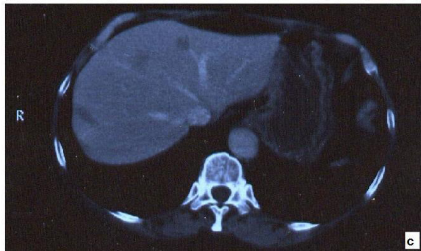
Figure 1 Microscopy and Endoscopy pictures at diagnosis in November 2001. a: shows pictures of H and E staining, b: KIT positive staining c: Endoscopic findings.

more than 10 mitotic activities per 50 high power fields (HPF) (Figure 1a). The tumour was found to be positive for a deletion mutation in exon-11 (of the c-KIT exon) (Figure 1b). Computerised tomography (CT) of the abdomen showed multiple metastatic deposits in the liver (Figure 2a). At laparotomy the tumour was found to involve the liver, pancreas and omentum. A hard lump in the right paracolic gutter was inseparable from the right kidney. Owing to the extensive nature of the disease the abdomen was closed without any resection.