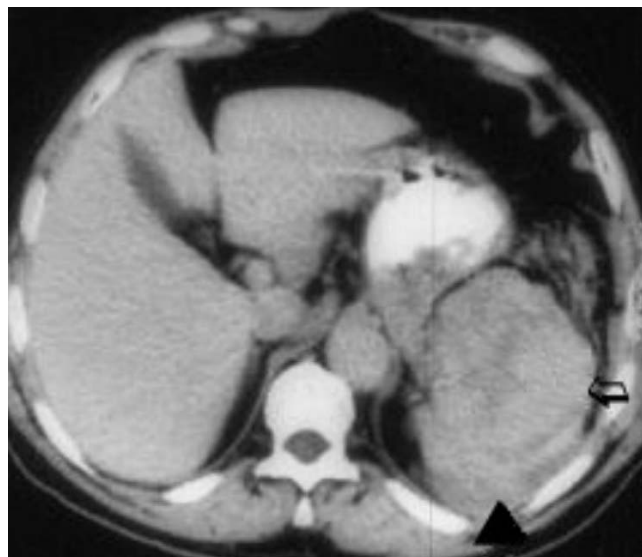
Figure 1 Abdominal computed tomography scan demonstrating intra-abdominal free fluid (arrowhead) and an enlarged, anechoic spleen with hypoechoic areas representing focal necrosis (arrow).

Laparotomy revealed a huge, actively bleeding spleen; more than one liter of blood had filled the intraperitoneal cavity. No abnormal adhesions were detected between the spleen, the diaphragm, or other organs, and macroscopic examination of all four abdominal quadrants did not reveal any other pathology. Splenectomy was performed along with peritoneal lavage with warm saline to evacuate the clots. Intraoperatively, the patient received two units