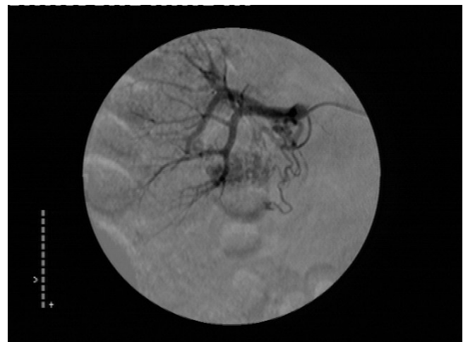
Figure 2 Selective digital subtraction arteriography of the right kidney showing an area of tortuous vascular channels located in the lower renal pole. The image taken a few seconds after the injection of contrast material demonstrates also early filling of the renal vein.

Women are affected three times as often as men, and the right kidney is involved slightly more often than the left. Renal AVMs are rare causes of hematuria. Congenital renal AVMs are of two general types: cirroid, with multiple varix-like vascular communications which represents a truly congenital form of arteriovenous malformation [2];