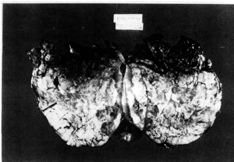
Fig. 1. (A) Magnetic resonance imaging showed a large pelvic mass displacing rectum medially and anteriorly. (B) Bisected tumor mass revealed a variegated tan light yellow to tan brown cut surface with extensive necrosis, focal hemorrhage and gelatinous degeneration.