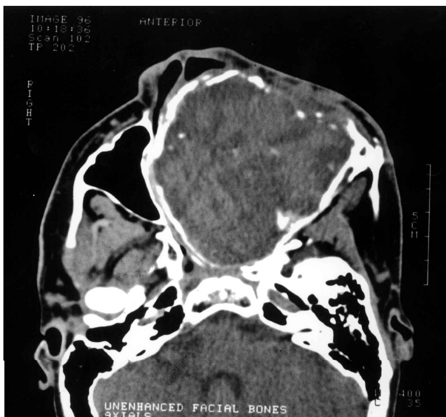
Fig. 2. Pre-treatment CT scan showing a large mass in the left maxillary sinus, bulging into the right maxillary sinus, nearly obliterating nasal passages.

Follow-up examinations have demonstrated reduction in the tumor mass, gradually increasing calcification on CT scan, and noticeable reduction of soft tissue disease in the frontal sinus, orbit and maxillary sinus (Fig. 3). While there is persistent proptosis, the patient continues to have vision in the treated left eye. At last follow-up (December 1998), the 17-year-old boy conducts an active life, participates in sports, has no pain, and feels well. There has been