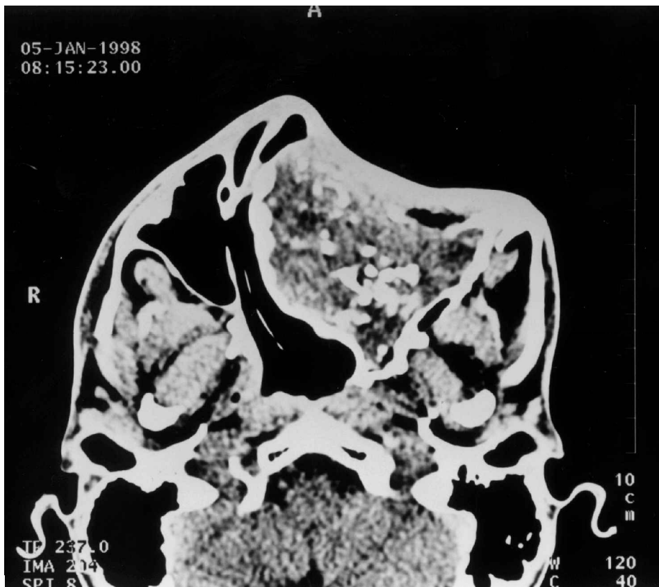
Fig. 3. Post-treatment CT scan January 1998 demonstrating facial recontouring, reduction of tumor, and calcification within the tumor.

some re-contouring of the facial structures associated with very slow regression of the mass (Fig. 4). On CT scan dated 12/98, the tumor mass measured