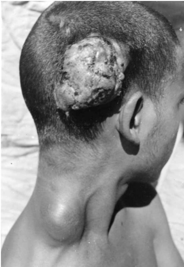
Fig. 1. Pre-operative photograph showing the primary scalp tumor with cervical lymph node metastases.