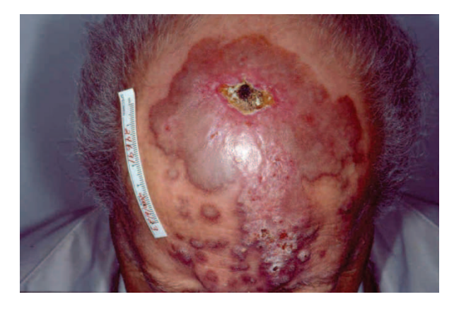
Figure 2. Progression of cutaneous angiosarcoma following two cycles of \mathsf{Caelyx}^{\mathbb{B}} .

As early as the first week following the completion of the radiation therapy there was evidence of tumour flattening and formation of eschars. At one month follow-up it was noted that there was significant fading of the tumour area and that the lesion had flattened. Continued improvement with further fading of the pigmented areas has occurred over the ensuing months. The patient has now been followed