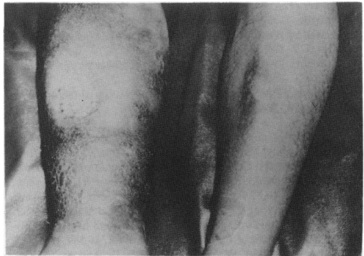
Figure 2 Chronic ulcer of right leg from Pythium insidiosum .

The third occurrence of the disease presented as keratitis reported first in 1988. 12 After that there were also sporadic reports of keratitis from P. insidiosum . 13-15 (Fig. 1). All patients lived in rural areas and most were farmers, and had a history of abrasion or injury. Clinical signs and symptoms could not be differentiated from those of other mycotic keratitis. The patients end up with keratoplasty, evisceration or enucleation. In contrast to the first and second occurrences, a history of haemoglobinopathy was not important as underlying disease of the patients.