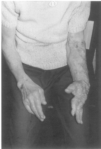
Figure 1 Hypertrophied left arm showing superficial varicosities