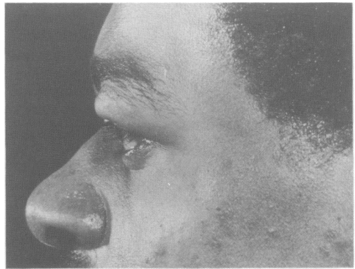
Figure 3 Lateral view of left upper eyelid swelling in patient before treatment.

It appears that the condition can affect any age group and has an equal sex distribution. Typically the major presenting feature is a rapidly expanding soft tissue mass which might be tender to palpation. The majority of lesions are present from 2 to 8