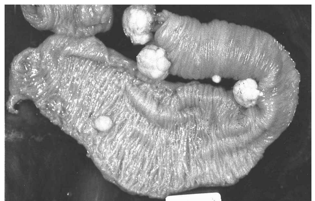
Fig. 2. Small intestine with polypoid mucosal metastases from alveolar soft part sarcoma. Note the intussusception polyp at the top center.

The small bowel resection was in two parts, with the larger 43 cm segment containing five sessile polypoid