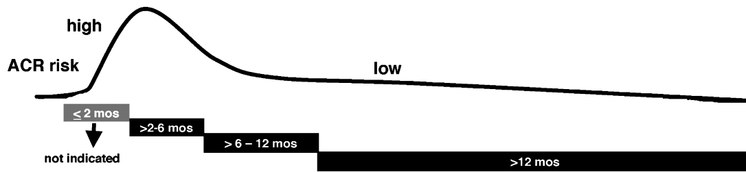
FIG. 1. Time-dependent risk and incidence of acute cellular rejection in heart transplant recipients. The risk for acute cellular rejection (ACR) is highest immediately post-operatively, declines during the remainder of the first year, and remains an ongoing clinical concern.