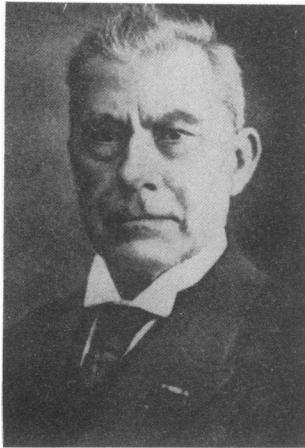
MARTINUS WILLEM BEIJERINCK