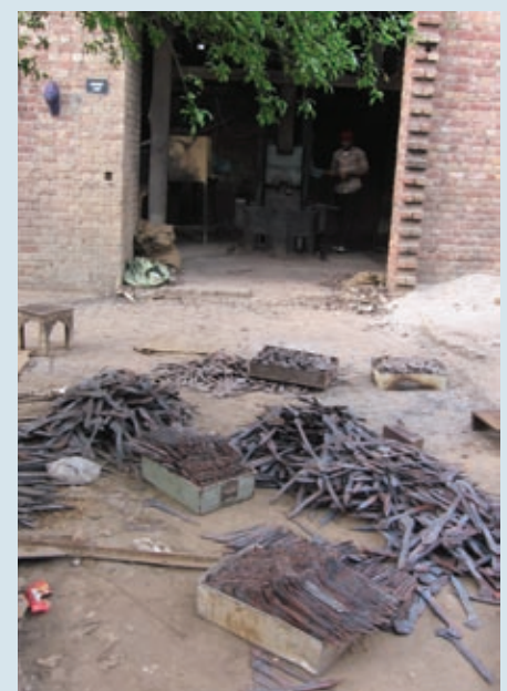
Surgical instruments in the courtyard of a forge in Pakistan before they are sent for polishing