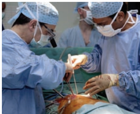
Doctors perform heart valve surgery

The inquiry found that poor organisation compromised the quality of care in two thirds of cases and that almost half of trusts don't follow national service framework protocols for coronary artery disease for refer-