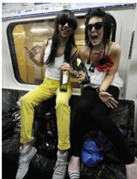
Londoners partying before alcohol was banned on the tube network from 1 June 2008