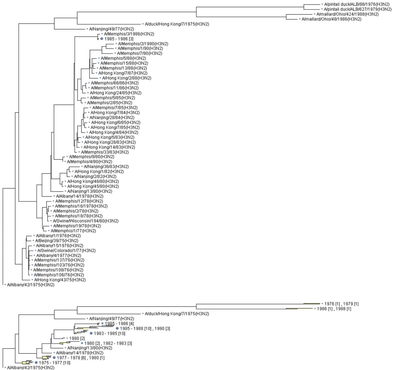
Figure 2 A full-resolution tree (top) and aggregated tree (bottom) built for 60 HA protein coding sequences for Influenza A H3N2 viruses extracted from human hosts during a 15-year period 1970–1985 (we used F84 distance and the neighbor-joining method).

Set N \leftarrow N + |\Lambda_{i_0}| - 1.