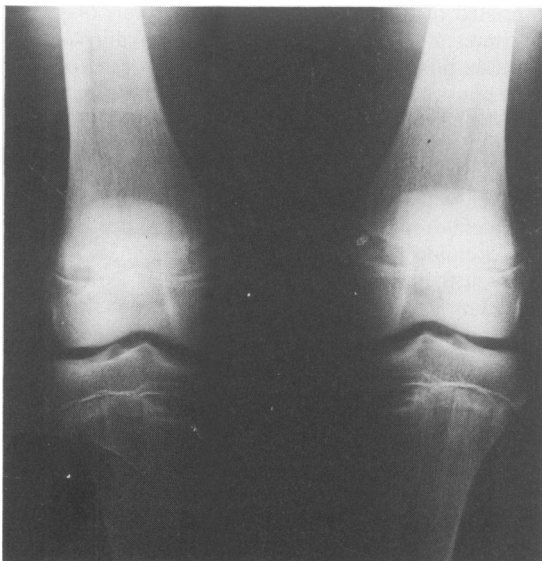
Figure 1 Radiograph of knees showing advanced rickets. There is gross widening of all the epiphyseal plates.

Values of serum 25-OHD below 5 ng/ml, corrected serum calcium below 2.22 mmol/l and serum inorganic phosphorus below the normal range for age and sex given by Round (1973) between 8–16 y (1.2–0.97 mmol/l) were regarded as abnormal. Serum alkaline phosphatase levels rise to between three and four times normal adult levels at the pubertal growth spurt and return to adult levels at about 16 y in girls and about 18 y in boys. Based on our own laboratory experience and that of two large recent studies of reference ranges in Spanish and French children (Schiele et al. , 1983; Gomez et al. , 1984), levels of alkaline phosphatase above 400 IU/l representing approximately the 95th (Schiele et al. , 1983) or the 97th (Gomaz et al. , 1984) percentile of the peak associated with the pubertal growth spurt were regarded as abnormal (adult reference range 40–115 IU/l). Levels of between 300–399 IU/l were regarded as marginally elevated to take account of the lower upper limits of normal in children before and following the pubertal growth spurt; these levels were not found to be associated with significant evidence of rachitic bone disease on X-ray (see below).