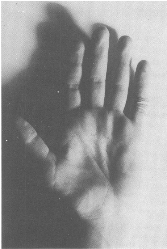
Figure 1 Photograph showing marked thenar, hypothenar and small muscle wasting in peripheral neuropathy, secondary to hypereosinophilic syndrome.

potentials were obtained on the first occasion only. The results of right ulnar nerve conduction studies are given in Table I. Autonomic function studies were performed as described by Ewing & Clarke (1982) and these indicated parasympathetic damage. Sural nerve biopsy revealed perineural fibrosis and focal myelin degeneration but no inflammatory cell infiltrate or arteritic lesions.