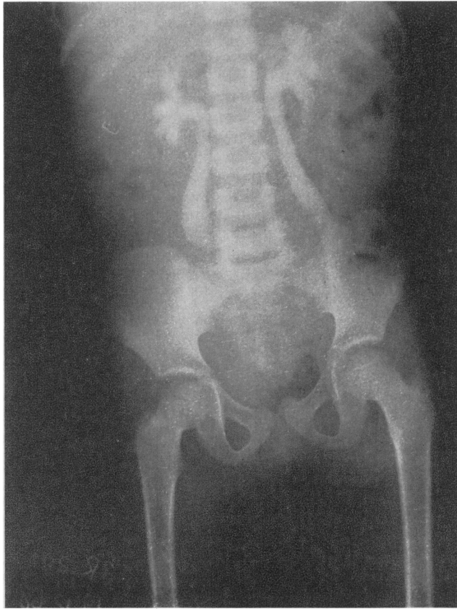
FIG. 2. Intravenous pyelography of case 1, showing bilateral hydro-nephrosis and bilateral hydro-ureter.

like diabetes insipidus is usually diagnosed in the second decade.