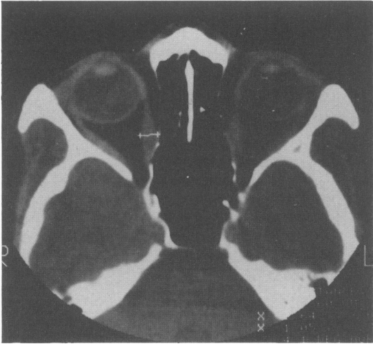
Figure 4 CT scan after orbital irradiation showing reduction in size of extraocular muscles.

both systemic as well as local orbital immunological processes have been implicated. The evidence includes the binding to extra-ocular muscles of immune complexes of thyroglobulin and its antibodies 6 , the finding of circulating antibodies directed against an