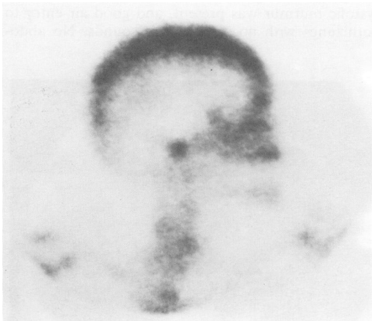
Figure 2 ^{99m}\text{Tc} bone scan of the skull, showing increased uptake at the cranial vertex.

Chest X-ray revealed enlarged heart, hilar prominence and interstitial lung infiltrates. A computed tomograph (CT) scan of chest and abdomen disclosed hilar lymphadenopathy, splenomegaly and retro peritoneal lymphadenopathy. Bilateral xeromammographic examination disclosed no evidence of malignant tumour. A ^{99m}\text{Tc} bone scan (Figure 2) revealed numerous areas of increased uptake in the skull. A gallium-67 scan showed marked bilateral uptake in the lungs with a picture compatible with a diffuse interstitial process. In addition, there was marked uptake of gallium in the skull. There was no radiological or bone scan evidence of involvement of other parts of the skeleton. Bronchoscopy was normal except for a suspicious nasopharyngeal plaque which was biopsied. A biopsy of one of the skin lesions was also undertaken. The pathological report of both specimens was that of multiple non-caseating granulomas, containing epithelioid cells