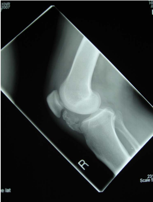
Figure 1 Lateral radiograph of the knee demonstrating ossification in the peritendinous tissues.

joints (Figure 1). Magnetic resonance imaging shows the ossified tissues as low signal and appears dark on both T1 and T2 weighted images. The increased bright signal on T2 shows the cartilage within the osteochondroma and oedema within the fat pad. The fat pad has high signal on the T1 image (Figure 2). The lesion was located in the extra-synovial tissues of the fat pad.