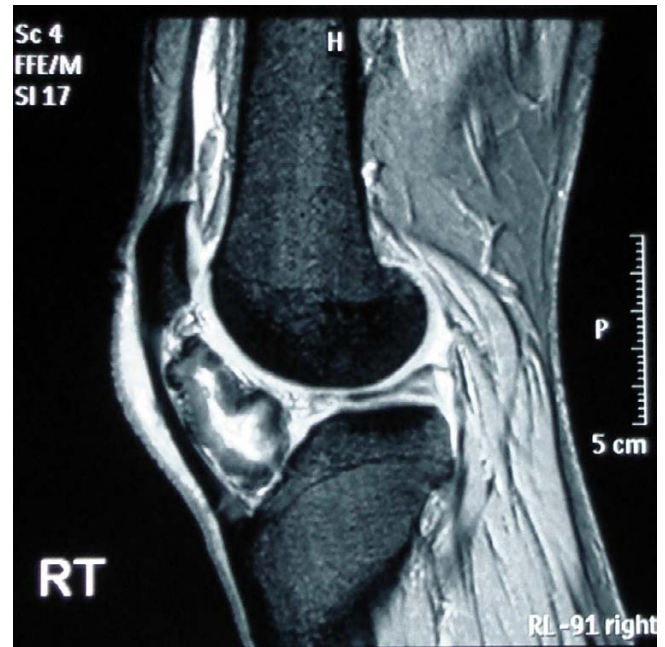
Figure 2 Sagittal magnetic resonance scans of the knee. The ossified tissues have low signal and appear dark on both T1 and T2 weighted images. The increased bright signal on T2 shows the oedema within the fat pad. The fat pad has high signal on the T1 image.

Arthroscopy confirmed normal menisci and no evidence of chondral injury but there was thickening to the infrapatellar fat pad. The calcified lesion within the fat pad was excised through a lateral para-patellar approach using a midline incision. The lesion was 45 mm in diameter, and had been completely excised. On microscopic examination it was composed of acellular dense hyalinised fibrocollagenous tissue with evidence of focal ossification, cartilaginous metaplasia and calcification. Figure 3, magnification \times 40 , with haematoxylin and eosin staining, shows the enclosing large clear fat cells of the infrapatellar fat pad (solid arrow). There is a peripheral rim of woven immature bone, seen as haphazard pink cells (hollow arrow) enclosing the fibrocollagenous centre.