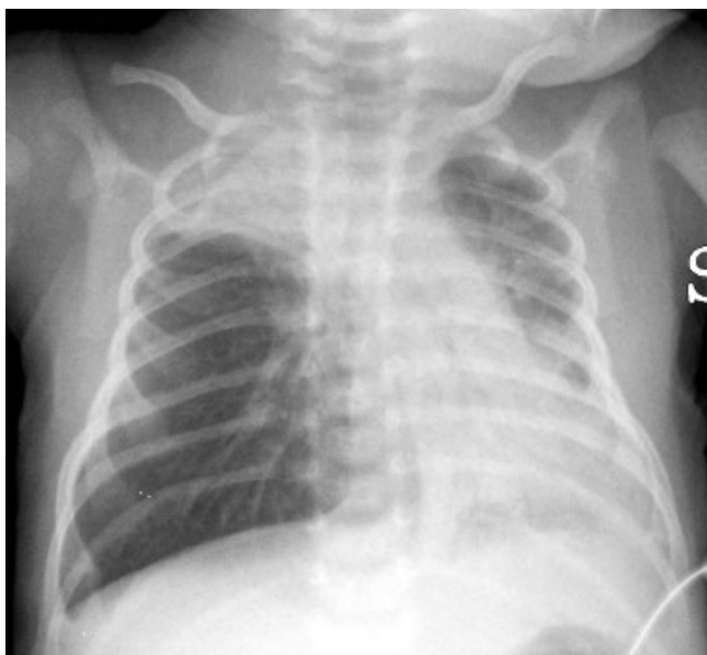
Figure 1 Chest X-ray on admission to the emergency room.

Initially manual ventilation and then supplemental humidified oxygen, inhaled bronchodilators and intravenous corticosteroids led to a mild clinical improvement in the patient's condition, but this treatment did not sufficiently increase gas exchange or lead to a sufficient