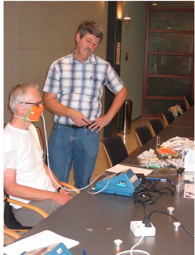
Figure 1. Protection factor of home-made mask being measured by Portacount in volunteer. Volunteer with home-made mask made of tea cloth. Note the candles in the foreground and the other mask types in the background. doi:10.1371/journal.pone.0002618.g001

In the second long-term experiment, 22 volunteers, all adults, 10 men, 12 women were divided into 3 groups. Each group wore a single type of mask for a period of three hours, being either a FFP2 mask (4 males, 4 females), a surgical mask (3 males, 4 females) or a home-made mask (3 males, 4 females), similar to the masks used in the short-term experiment described above. At the beginning and end of each three-hour period, full series of measurements were taken using the standardised protocol as described for the short-term experiment, and during the three hour period while wearing the masks, participants reported back at regular intervals for a short measurement during rest (absence of activity). For the remainder of the period, participants carried on with their usual daily activities. During regular activities in between measurements, the probes of the masks were plugged which did not involve dislodging of the masks.