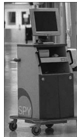
Figure 1. The SPY imaging system.

The SPY imaging system (Novadaq Technologies Inc., Toronto, Canada) comprises an imaging head, containing the optical components, attached to a cart by means of an articulated arm. The cart contains electronics, a computer, and a video monitor ( Figure 1 ). The imaging is based on the fluorescence