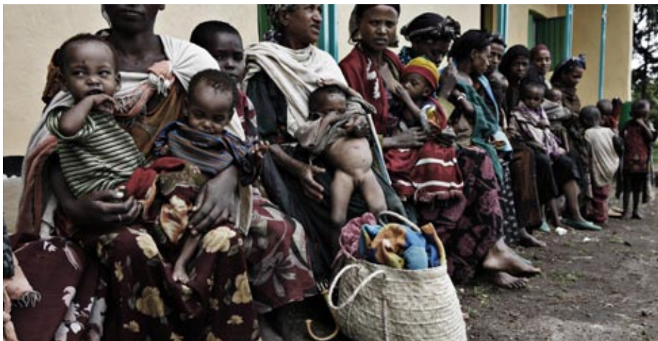
Women queue to get treatment for their malnourished children in Lerra village, southern Ethiopia