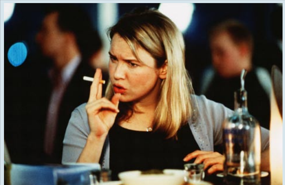
Children's smoking is blamed on pro-smoking images in films, such as Bridget Jones's Diary (above)