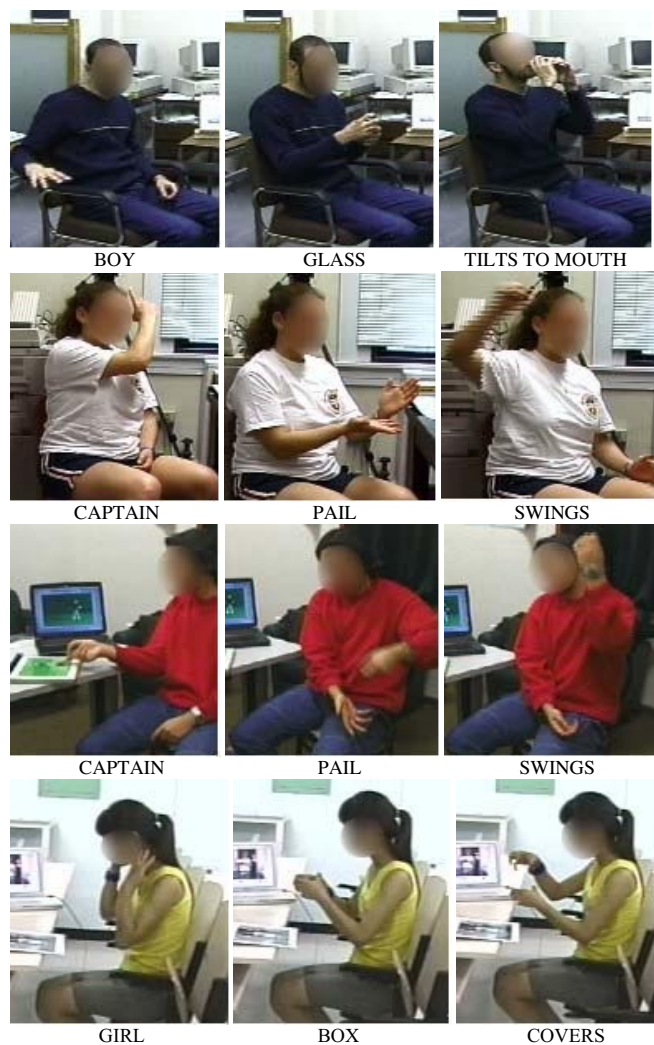
Fig. 1. Examples of ArPA gesture strings produced by speakers of all four languages. (Top) The pictures show a Spanish speaker describing the boy tilts glass vignette. (Middle) The pictures show an English speaker and a Turkish speaker describing the captain swings pail vignette; note that the English speaker (Upper Middle) conveys the captain by producing a gesture for his cap, the Turkish speaker (Lower Middle) by pointing at the still picture of the captain. (Bottom) The pictures show a Chinese speaker describing the girl covers box vignette.

different objects becomes apparent only after the action gestures, tilt-to-mouth and cover, are produced. Despite the fact that an action gesture is often needed to disambiguate an object gesture, participants in all four language groups produced gestures for objects (Ar and P) before producing gestures for actions. In this regard, it is worth noting that the ArPA ordering pattern we have found is not inevitable in the manual modality. In many conventional sign languages, including American Sign Language (8), the canonical underlying order is SVO—ArAP in our terms; thus patients do not necessarily appear before acts in all communications in the manual modality.