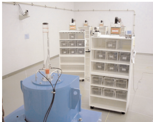
FIGURE 1. Long-term low-dose-rate irradiation facility