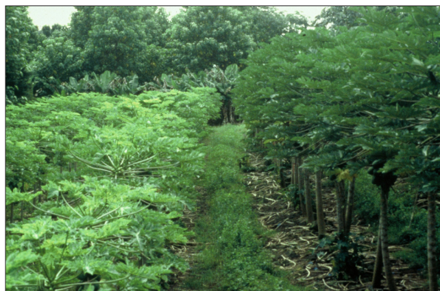
Figure 2 Field trial of transgenic papaya. The disease free transgenic papaya plants (the right side) and the severely infected and stunted non-transgenic papaya plants (the left side) growing in adjoining plots.

One possible explanation for the lower than expected number of genes is that the papaya genome did not undergo the two rounds of recent whole-genome duplication observed in Arabidopsis [12]. Analysis of syntenic blocks between papaya and Arabidopsis revealed that for single papaya genes,