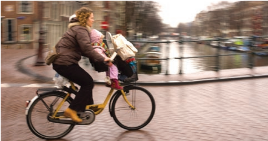
The rising age of starting a family reflects a fall in younger mothers in Holland, not a rise in older ones