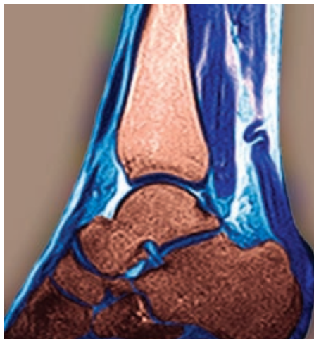
Fluoroquinolones raise risk of ruptured Achilles tendon