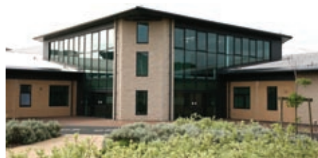
Thousands of Welsh patients cross the border to attend the Royal Shrewsbury Hospital, Shropshire