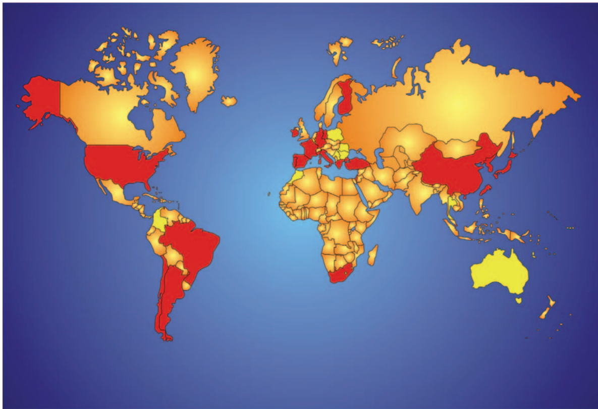
FIG. 2. Countries that have reported an outbreak of carbapenem-resistant Acinetobacter baumannii . Red signifies outbreaks reported before 2006, and yellow signifies outbreaks reported since 2006.

(42, 488). Intercontinental spread of multidrug-resistant A. baumannii has also been described between Europe and other countries as a consequence of airline travel (383, 421). These events highlight the importance of appropriate screening and possible isolation of patients transferred from countries with high rates of drug-resistant organisms.