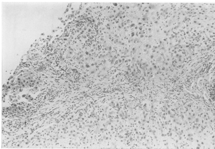
FIG. 1. The portal tract is enlarged owing to irregular fibrosis and there is an inflammatory exudate extending into the parenchyma. Haematoxylin and eosin \times 90 .

Undoubtedly, this is a case of polymyalgia rheumatica with chronic liver disease. Laboratory tests in previous cases (Dickson et al. , 1973; Long and James, 1974) particularly with isoenzyme studies of alkaline phosphatase, suggest the presence of hepatic dysfunction with involvement of the biliary excretory system. In this case, although no mitochondrial antibodies were present, the histological changes were more in favour of a disease process such as primary biliary cirrhosis rather than large duct obstruction or a hypersensitivity cholestatic reaction. In a recent review of liver diseases in