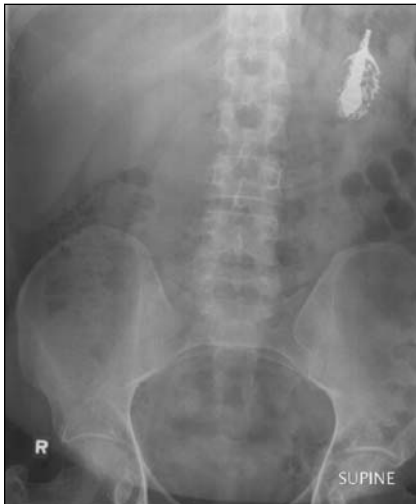
FIG. 2. Abdominal radiograph showing the retained foreign object in the stomach 2 months after ingestion.

extract the aspirated foreign body by flexible and rigid bronchoscopy. The endoscopic approach proved to be futile, and a right thoracotomy was performed. The 10-cm steak-knife blade was subsequently removed through a right tracheobronchotomy without complication. A week later, an attempt at endoscopic removal of the foreign body from the stomach was also unsuccessful. As this object had not passed beyond the stomach for many weeks and appeared to be partially embedded into the gastric wall, a gastrotomy was performed, and a partially digested metallic spoon was removed. After satisfactory psychiatric evaluation, the patient was discharged from the hospital about 4 weeks after admission. He continued to do well and had no evidence of airway stenosis on bron-