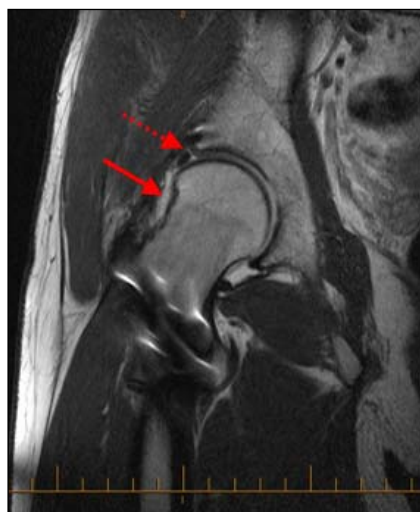
FIG. 2. Postoperative arthro-magnetic resonance image showing possible persistent labral tear (dotted red arrow), without evidence of granulomatous tissue on the remodelled femoral neck after the osteoplasty (plain red arrow).

Such materials may be tissue-friendly alternatives to traditional bone wax. Nevertheless, when necessary, bone wax should be used just for the time needed to achieve hemostasis. If it is left in place, meticulous removal of excess is strongly recommended. We have stopped using this material after femoral neck osteoplasty because bleeding is minimal and capsular adhesion can now be avoided with more aggressive postoperative rehabilitation. When significant bleeding