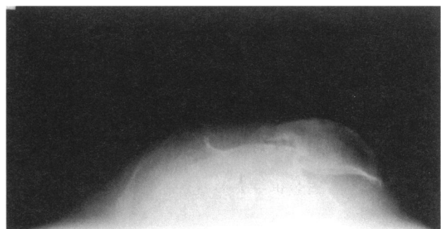
Figure 1 Skyline view showing dislocated patella locked on lateral femoral condyle.

It was decided that a total condylar PCL substituting knee replacement with patellar resurfacing should be carried out. A tear of the medial retinaculum was noted, along with damage to trochlear surface of lateral femoral condyle and an impaction fracture of medial patellar facet. A lateral retinacular release, with repair of medial patellar retinacular complex, including advancement of vastus medialis obliquus was required to achieve good patellar tracking. Postoperatively, the patient had a stable knee with flexion up to 90° and good patellar tracking.