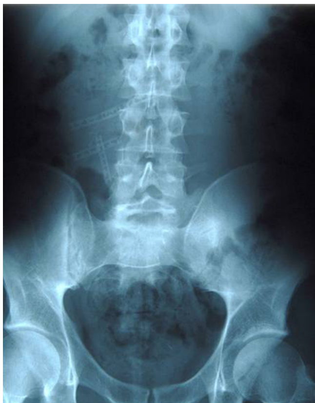
Fig 1. Razor blades in the small bowel.

Deliberate ingestion of foreign bodies is common amongst prison inmates. The motives behind the ingestion are variable. As the only designated hospital in Northern Ireland treating acute surgical pathologies in the prison population, we reviewed our experience of foreign body ingestion between March 1998 and June 2007. Types of foreign objects, symptomatology, haematological analyses, radiological findings, operative intervention and complications were retrieved from case notes. A literature search was performed using Medline to correlate this clinical data with published evidence to produce therapeutic guidelines to assist the surgical multi-disciplinary team.