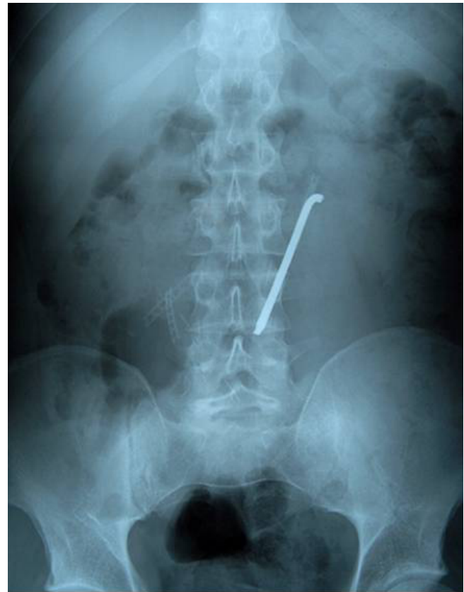
Fig 5. Re-ingestion of metallic rod combined with previous ingestion of razor blades as shown in Figure 1.

Endoscopic retrieval of sharp objects, such as razor blades, straightened paperclips and needles that are lodged in the oesophagus should be performed urgently 1,2 . If the object progresses into the stomach or duodenum, immediate attempts at endoscopic retrieval should be undertaken, as the risk of perforation at the ileocaecal valve is approximately 35% 1,2,9 . If the sharp object has passed beyond the duodenum, the patient should be monitored with daily radiographs and remain under strict observation. Surgical intervention may be required if a sharp object fails to progress radiologically after 72-hours. Emergency laparotomy is required if the patient develops acute clinical signs 1,2 . All six patients that swallowed razor blades in our study presented after the blades had passed into the small bowel. None of them developed symptoms of obstruction or perforation and consequently were successfully managed conservatively.