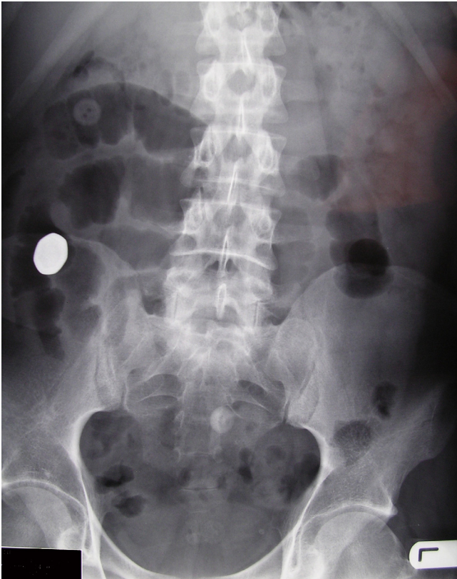
Fig 2. 20-pence coin in the right iliac fossa. Dilated loops of small bowel proximal to coin.

colon were resected with a primary anastomosis performed. Histopathological analysis revealed Crohn's Disease with stricturing distal to the impacted 20-pence coin 4 . Patient 11 was admitted after intentionally swallowing a wrist-watch 6-weeks prior to presentation. Endoscopic retrieval from the ileo-caecal junction was successful (Figs 3, 4). Two further patients (9 & 10) required operative intervention for continuing obstructive symptomatology. An enterotomy was performed with extraction of the metallic foreign body followed by primary closure in both instances.