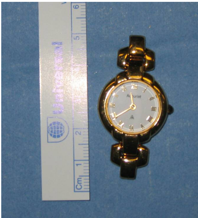
Fig 4. Endoscopic retrieval of wrist-watch was successful. The watch was still functioning.

retrieval net was superior to the basket or forceps technique 11 . If the blunt object has passed in to the stomach and is less than 2cm in diameter, a conservative outpatient management protocol with weekly radiographs should be adopted. If the blunt object remains in the stomach, it has been recommended to delay endoscopic retrieval for 1-2 months to facilitate any opportunity for spontaneous passage 2,5,11,12 . Blaho et al also recommend a 3–4 week waiting period to allow passage before attempts at endoscopic retrieval are made 5 . Zuloaga et al suggest a two month waiting period 12 . One of the patients in our study presented with a five week history of colicky right iliac fossa pain. The abdominal X-ray on presentation revealed a wrist-watch in the right iliac fossa suggestive of probable impaction at the terminal ileum (Fig 3). Repeat X-rays showed