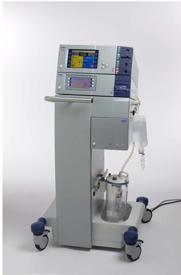
Figure 1. Water-jet dissector (Helix Hydro-Jet®; Erbe Elektromedizin GmbH, Tuebingen, Germany).

In laparoscopic surgery the water-jet was applied through angularly adjustable handpieces and lately