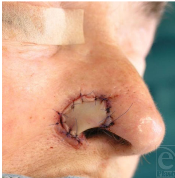
Figure 5. Perichondral graft applied on the nostril defect.