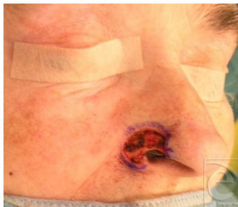
Figure 2. Resection of tumor revealing a hemialadefect.