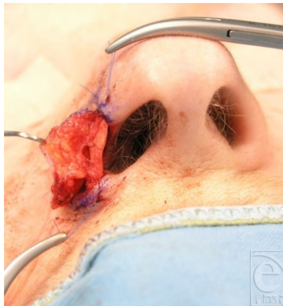
Figure 4. Setting in of the graft with focus on the cartilage strip that creates the lower rim.