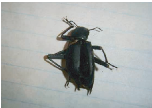
Fig. 1. The cockroach discovered in the patient's mouth.

eosinophils) was normal. She was treated with levamisole (3 mg/kg/day for 3 days) in lieu of pyrantel pamoate. After the treatment, the patient's clinical symptoms reduced within 2 weeks and there was no more report of passing worms.