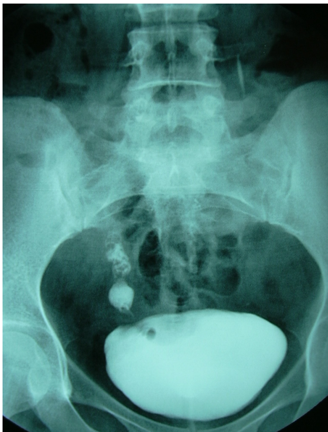
Figure 1 Intravenous urographic demonstration of fibroepithelial polyps in distal ureter with filling defects.

the root area through the ureteroscope and manipulated for frozen biopsy. The results of the urine cytology were negative, and the analysis of the frozen section demonstrated a benign FEP. Then the ureteroscope was inserted into the right ureter through the guide wire and the calculus was fragmented by pneumatic lithotripsy and fragments were extracted with a basket. About 1 cm proximally to the calculi, multiple millimetric polypoid structures were exposed and all of them were resected as described above. The bases of the polyps were coagulated with an electrode to stop bleeding and prevent recurrences. A ureteral stent was placed to provide urine drainage and to avoid probable obstruction caused by edema, then removed 24 hours later.