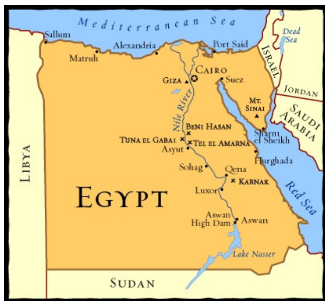
Figure 1 Map of Egypt.

The study was carried out in Upper Egypt which is a narrow strip of land that extends from the cataract boundaries of modern-day Aswan to the area between El-Aiyat and Zawyet Dahshur, south of modern-day Cairo, Figure 1.