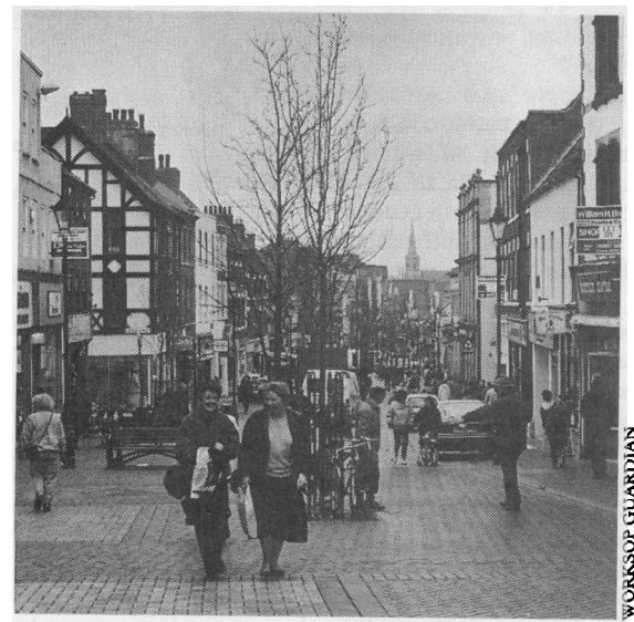
Worksop's town centre