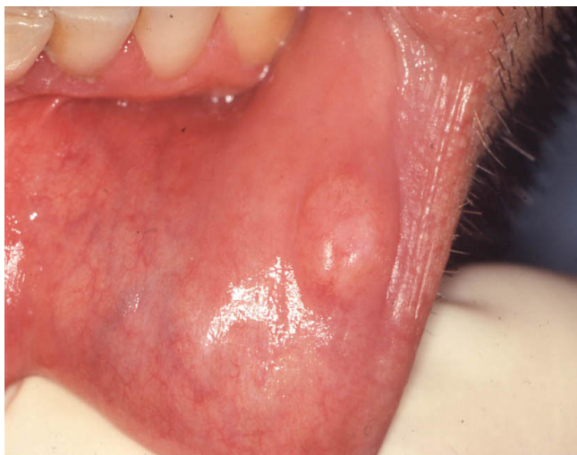
Figure 1 Clinical appearance of fibrolipoma. This lesion usually presents as an asymptomatic swelling of soft consistency, mobile on the surrounding tissues.

admixture of mature adipose tissue, including variably sized typical adipocytes, embedded within dense collagen fibres (Fig. 3), consistent with fibrolipoma. Regressive changes of the tissues located at the surgical margins, such as cellular hyperbasophilia, nuclear chromatin condensations or tissue coarctation were not detected.