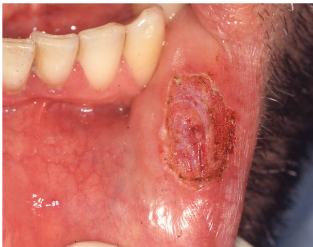
Figure 2 Clinical appearance of the surgical scar 10 days after surgery. The use of a diode laser with a 300 \mu\text{m} fibre and operating at 2,5 W allowed prompt recovery of the patient, with no inaeesthetic alterations of the adjacent tissues.

admixture of mature adipose tissue, including variably sized typical adipocytes, embedded within dense collagen fibres (Fig. 3), consistent with fibrolipoma. Regressive changes of the tissues located at the surgical margins, such as cellular hyperbasophilia, nuclear chromatin condensations or tissue coarctation were not detected.