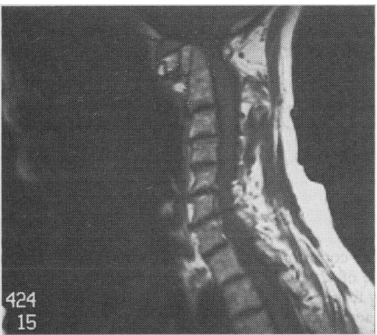
Magnetic resonance image of cervical spine showing spinal cord compression at C1 and C2.