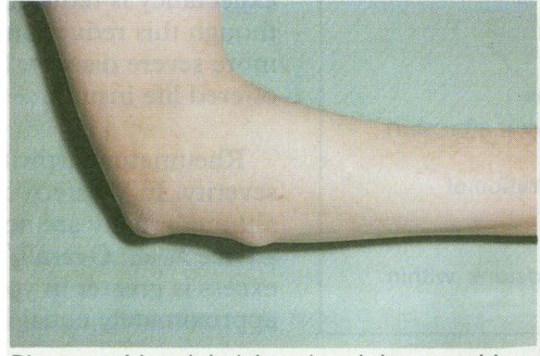
Rheumatoid nodule (above) and rheumatoid vasculitis (right).

Effusion of the knee may produce a popliteal (Baker's) cyst. This may rupture to cause diffuse pain and swelling in the calf that mimics deep vein thrombosis.