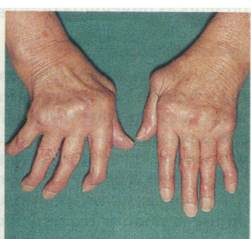
Effect of rheumatoid arthritis on the hand: (left) early changes and (right) later deformity.