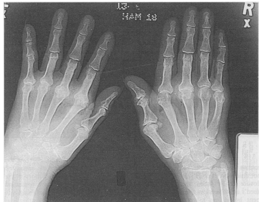
Radiograph of hands showing rheumatoid erosions.