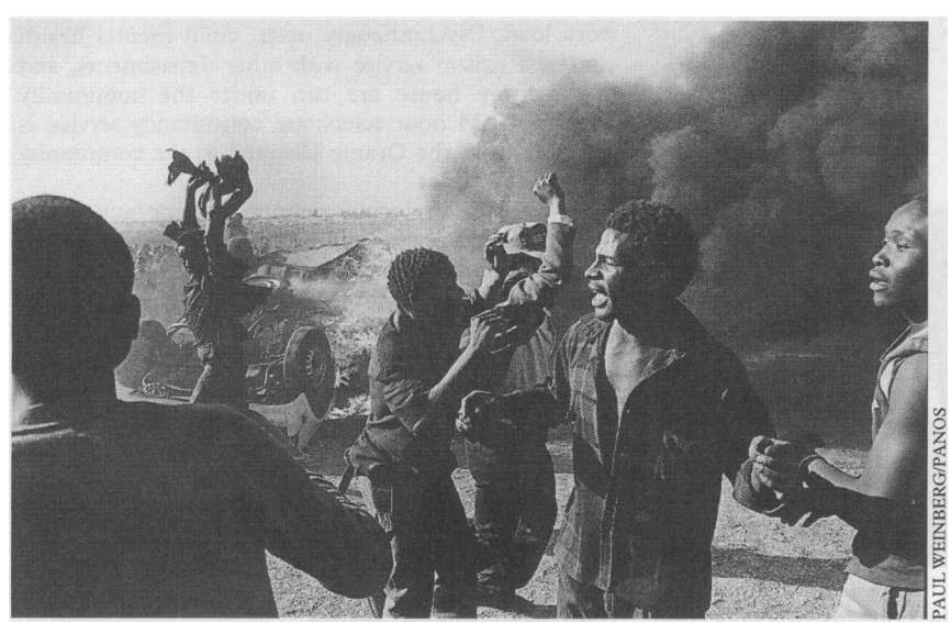
Mental health professionals felt that the phenomenon of apartheid belonged with politics, not the science of mental health