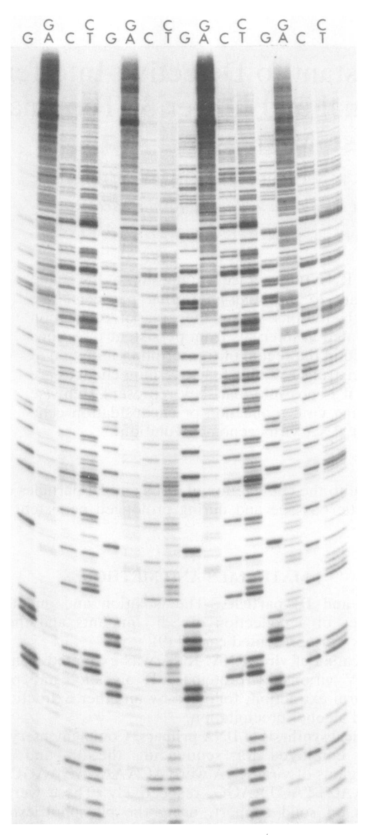
FIG. 1. DNA sequencing gel of DNA molecules extended from synthetic oligonucleotide primer exactly complementary to the first 13 bases at the 3' end of VSV isolates. The DNA sequencing method of Maxam and Gilbert (20) was employed on single-stranded DNA after primer extension by reverse transcriptase of <sup>32</sup>P-labeled dACAAACAGAAGCA. The sequencing patterns for four mutants are shown. For each mutant, the lanes from left to right display G, G+A, C, C+T.

was to synthesize a specific deoxynucleotide primer complementary to known sequences 3' proximal to one region of interest, extend the primer with reverse transcriptase, and sequence the reverse transcript. The dideoxy chain termination technique is usually the method of choice because of its relative ease compared with the method of Maxam and Gilbert (20). However, in our reverse transcriptase reaction with VSV RNA templates, we observed strong stops which led to ambiguities in sequence determination by the dideoxy method. Most of these ambiguities can be eliminated by utilizing chemical cleavage sequencing which yields 3' phosphate-containing fragments that can be electrophoretically resolved from the 3' hydroxyl-containing premature termina-