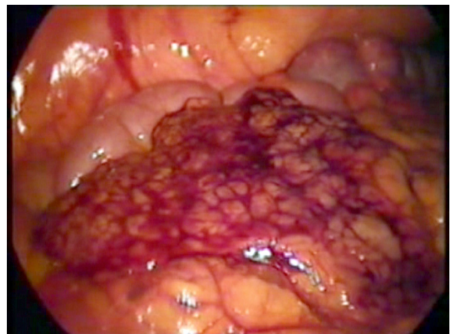
Figure 3 The detached segment of infarcted greater omentum lying over the bowel.