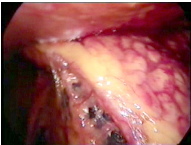
Figure 1 The involved segment of greater omentum adherent to the parietal wall on the right side.

would necessitate making a larger or complementary incision for excision of the infarcted omentum. Laparoscopic approach is safe and effective in managing idiopathic segmental infarction of greater omentum and is associated with low morbidity [7-9]. With the popularity of minimal access surgery increasing, more cases are being documented and reported. We would like to emphasize the usefulness of laparoscopy in patients with right lower quadrant pain, which is both diagnostic as well as therapeutic.