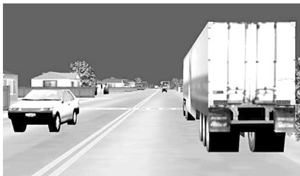
Figure 3 Simulator view: truck crosswalk scenario.

One of the potential weaknesses of the above study is that the trained novice drivers were evaluated on the driving simulator immediately after they had completed the PC based training. In order to remedy this shortcoming, the above study was replicated, only this time 12 novice drivers were evaluated on the simulator 3–5 days after training. 29 This represents a period of time which might elapse between PC based training in driver education classes and the novice driver's applying that training on the road as part of the learner's permit phase. Another set of 12 participants was