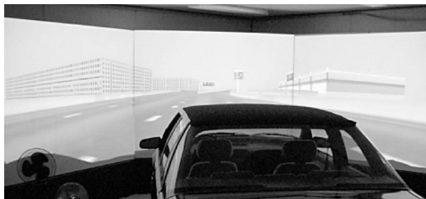
Figure 2 University of Massachusetts driving simulator.

lag behind it a reasonable distance (the lead vehicle indicated to the participant driver when to turn and in which direction).