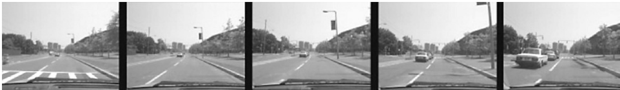
Figure 4 Sequence of (five) perspective snapshots for the abrupt lane change.

from these 10 locations in the field were scored blindly, and used to analyze the eye glance behavior of the drivers. We find that significantly more trained drivers (70%) in the near transfer scenarios fixated areas of the roadway scenarios which contained information which could reduce their likelihood of a crash than do untrained drivers (33%, p < 0.001 ), a difference almost identical to what was observed on the driving simulator. Furthermore, the differences in the trained (59%) and untrained (39%) drivers on the far transfer scenarios were smaller, though still significant ( p < 0.01 ).